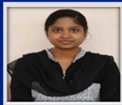
2018-22 - B Nagamani Amazon