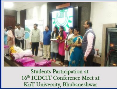
Students Participation at 16 th ICDCIT Conference Meet at KiiT University, Bhubaneswar