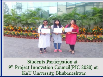
Students Participation at 9 th Project Innovation Council (PIC 2020) at KiiT University, Bhubaneswar