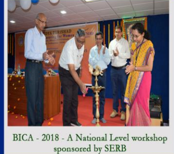
BICA - 2018 - A National Level workshop sponsored by SERB